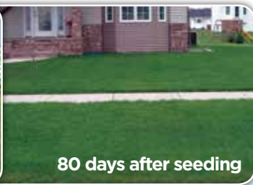
80 days after seeding